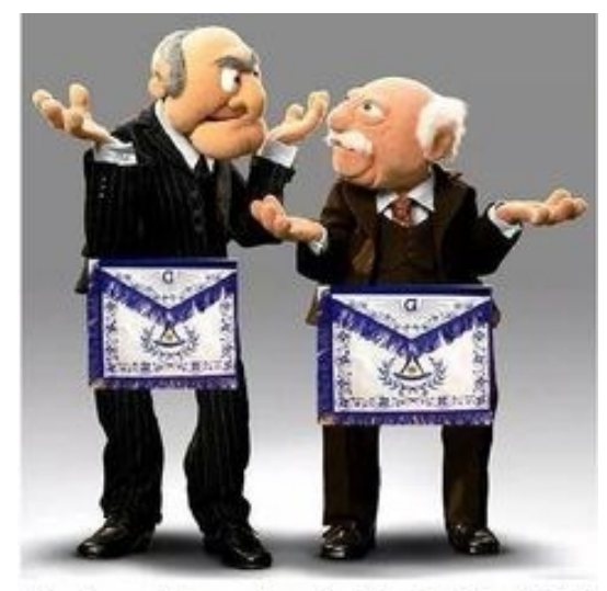
"You know, the new line of officers isn't half bad." "Nope, they're ALL bad!"